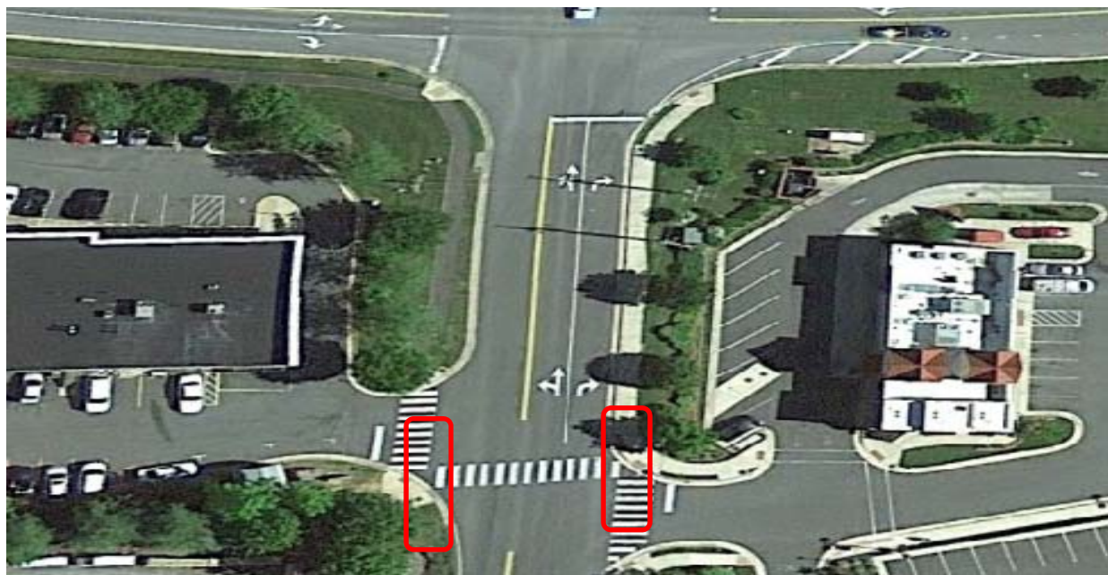
Location of crosswalks on Hatcher Avenue.