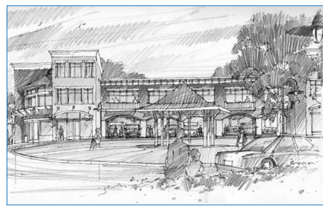
View from the intersection of 21st and 23rd Streets showing infill development ideas, including a farmer's market arcade.

After three years of work by citizens, Town advisory boards, and the Planning Commission, the Town Council adopted the Purcellville, Virginia 2025 Comprehensive Plan on December 19, 2006. This Plan, which updates the Town's 1998 Comprehensive Plan, continues Purcellville's long-standing goal to guide growth and change in a manner that protects our historic, small town character. In recognition of the tremendous residential growth that has occurred in Purcellville during recent years, the new Plan focuses on better aligning growth with the Town's ability to provide adequate utility services, while encouraging business growth to better balance the Town tax base and to maintain