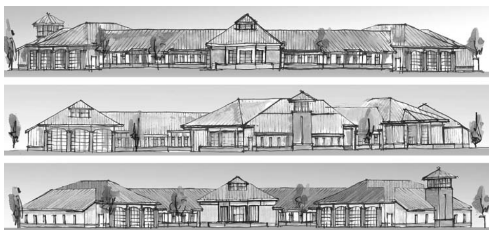
Above, elevations of the new Public Safety Center from (top to bottom) northwest, southeast and east directions.

Volunteers of the Purcellville Fire & Rescue Companies continue to work with the Town of Purcellville and Loudoun County toward completion of the design for the new Purcellville Public Safety Center at the corner of Hirst Rd. and Maple Ave. The final plans are almost complete and contractor bidding is expected to begin in March 2007. Ground breaking is tentatively scheduled for June/July 2007. After 12 - 14 months of construction, the Public Safety Center is scheduled to be open December 2008.